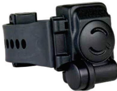
Figure 2. The TAD ankle bracelet