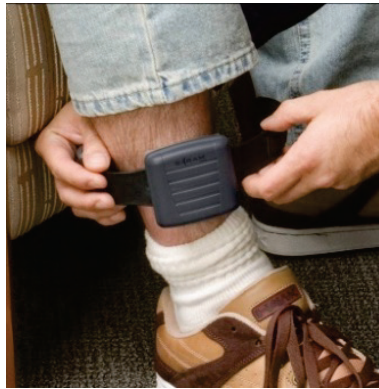
Figure 1. SCRAMx Bracelet

The SCRAM device has changed over time. The original SCRAM device contained alcohol sensing, data storage, communication, and battery power in two cup-like modules, one on each side of the ankle. The second-generation SCRAM2 device preserves the functionality of the original in a smaller, lighter bracelet with a single module. Since its development, the SCRAM2 device was further updated to include RF technology that allows it to function as a house arrest monitor capable of tracking times when the offender is within a given distance of the home. The RF feature can be turned off for offenders not under house arrest. It can be turned on and off remotely as an offender's house arrest status changes.